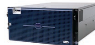
Secure 4150 — Enterprise 5U platform

The Secure Firewall is ideal for all business sizes and needs. Models range from our entry-level SMB model 210, to seven additional 1U and 2U model platforms, including a model for rugged-use environments and our multi-Gigabit enterprise-class 5U model 4150.